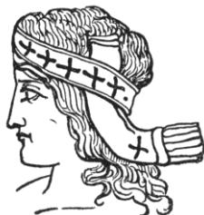
Ref: Two Babylon's, Alexander Hislop, woodcut 45 page 199

The picture below is a woodcut depiction of Bacchus the Babylonian Messiah. The symbol of the cross was the sign by which Bacchus was revered as deity.